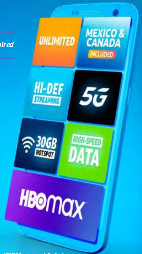
AT&T 5G coverage is limited. For coverage details, visit att.com/5G for you.

Get unlimited data, HD streaming, 30GB of mobile hotspot data, plus HBO Max TM included