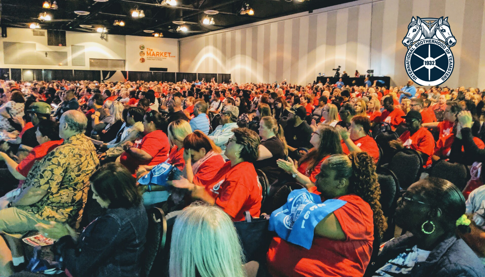
Above: Thousands of Teamsters from across the County attending the June 22nd Bargaining Update Rally at the Ontario Convention Center. Local 1932 rolled out the ultimately successful Teamster solutions for affordable healthcare.

move on towards resolving economic issues.