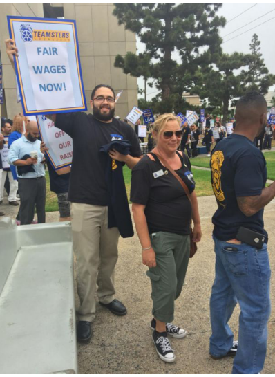
Marching in solidarity with Teamsters Local 2010

reports "As Volunteer Organizer, I enjoy going out and meeting new people helping to make a difference in people's lives, and getting to hear the stories behind why they need a Union. As a Steward, especially enjoy fighting for the rights of my coworkers on a regular basis. I have yet