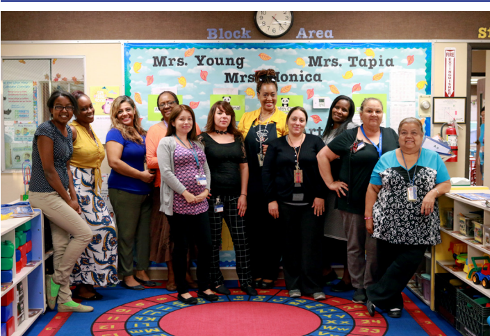
San Bernardino County Preschool Services Division Fontana Citrus Location

On November 4, 2016, formally turned in to County Human Resources in the form of Authorization for Representation cards, requesting that 503 Preschool employees be represented by Local 1932.