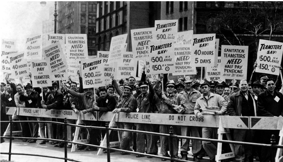
Teamster Union members holding picket signs supporting higher raises and pensions - 1954