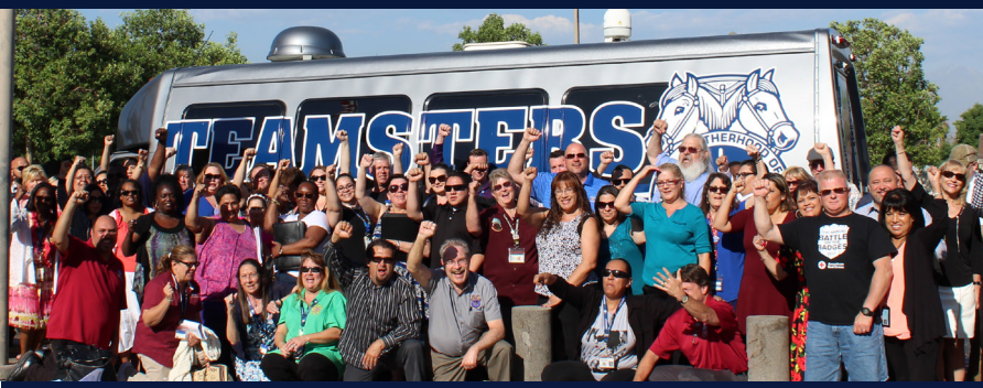
At our May County Steward Meeting, Stewards celebrated their new mobile office by posing in power in front of their new Local 1932-branded bus.